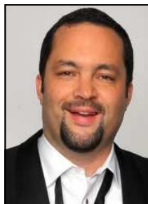
Ben Jealous Youngest President of the NAACP (MS, Comparative Social Research)