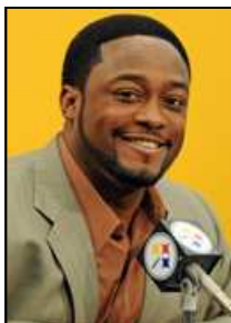
Mike Tomlin Youngest NFL Head Coach to win a Super Bowl (BA, Sociology)