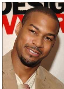
Finesse Mitchell Comedian, Actor, and Author (BS, Communications)