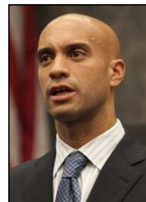
Adrian Fenty Youngest Mayor of Washington, DC (JD, Law)