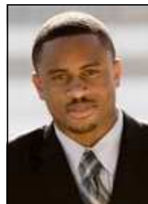
Nnamdi Asomugha Pro Bowl Cornerback, Oakland Raiders (BA, Corporate Finance)